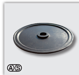
Knife for shear cut system