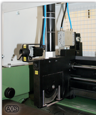
Knife holder type PK-30-P