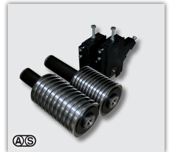
Knife set with 1 pair of knife set holder