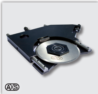
Knife holder type KK-15-F