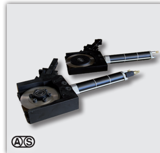
Knife holder type KK-30-P and KK-50-P