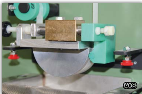
Tape coater with adhesive container

Joint directions type AL and AR (seen from the grain side). Recommended: type AL