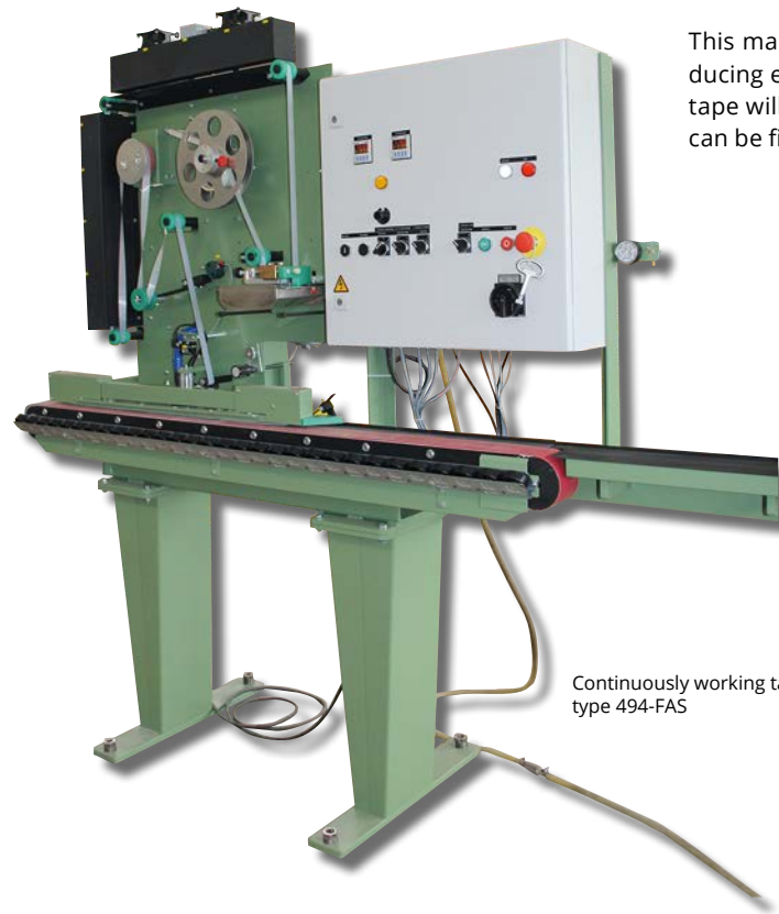
Continuously working tape applicator type 494-FAS