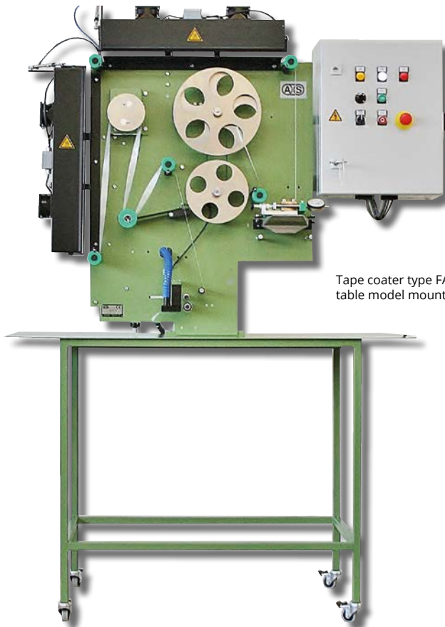
Tape coater type FAS table model mounted on mobile carriage

Tape coater (table model) for applying adhesive on the tape for the manual production of endless abrasive belts with tape joints. The tape coater is perfectly suited for pre-coated and uncoated tapes.