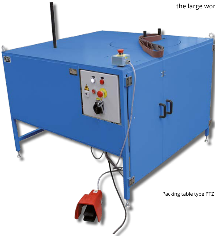
Packing table type PTZ

The packing table type PTZ facilitates the rewinding of flexible and coated endless abrasive belts. After rewinding, the roll can be efficiently packed on the large working surface.