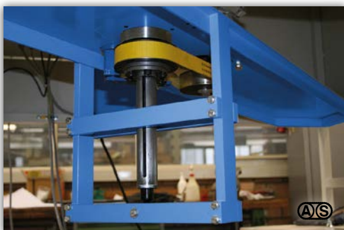
Torque control through flat drive belt