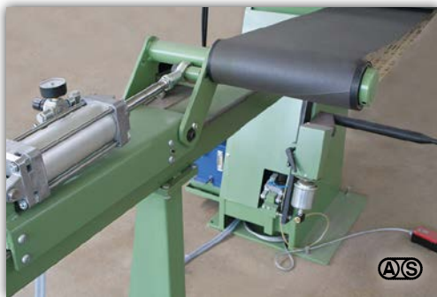
Horizontal belt stretcher