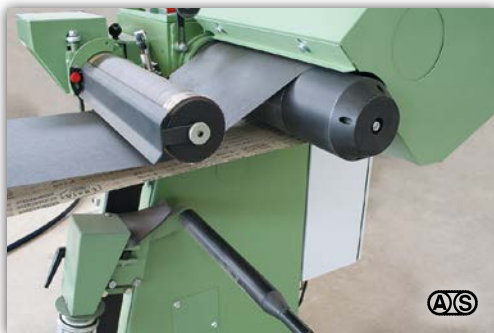
Cutting cylinder with automatic belt guiding system and short belt stretcher